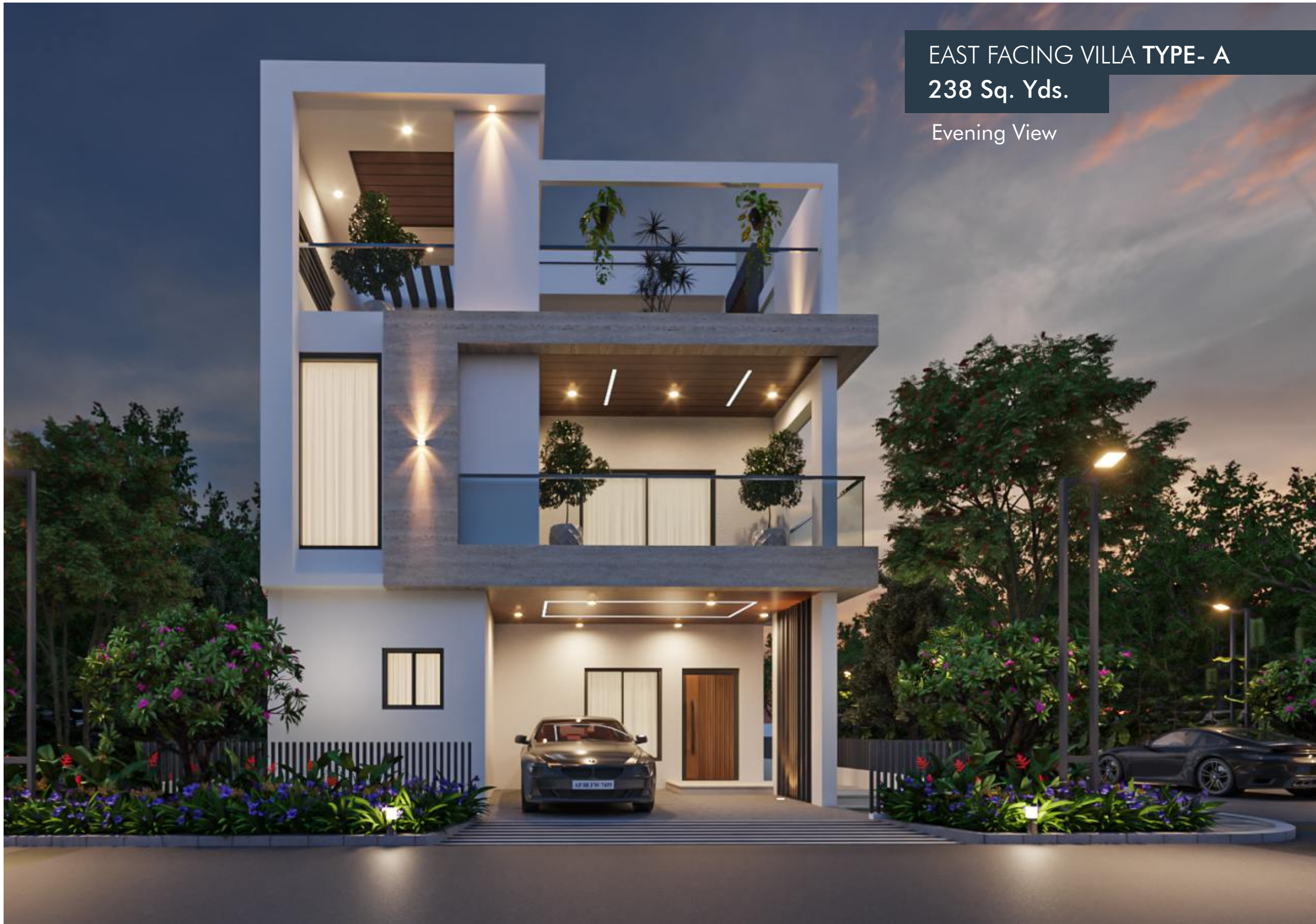
EAST FACING VILLA TYPE- A 238 Sq. Yds.