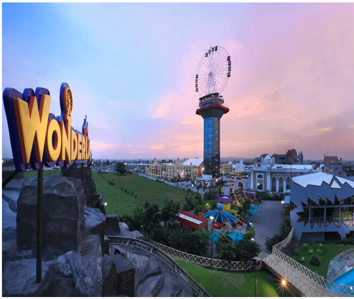
Wonderla Amusement Park