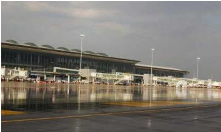
Rajiv Gandhi International Airport