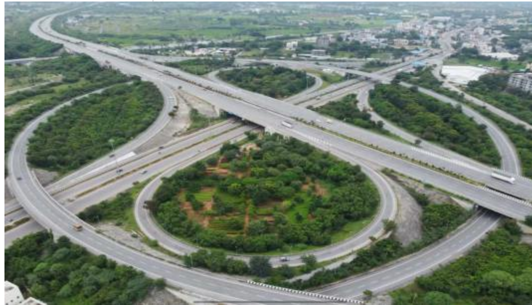
Outer Ring Road