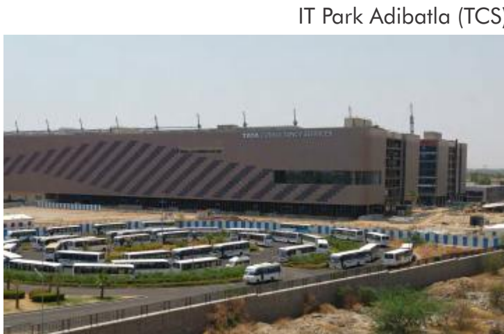
IT Park Adibatla (TCS)