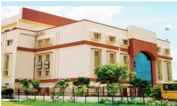
Delhi Public School